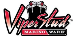
09.22.16 Non-Structural Metal Stud