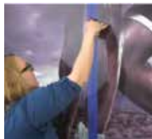
Smooth it out