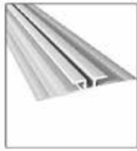
Square Channel F568