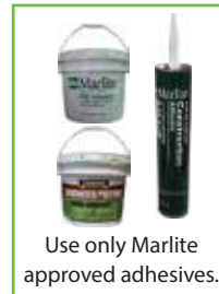
Use only Marlite approved adhesives.