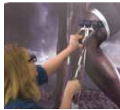
Roll panel after installation.