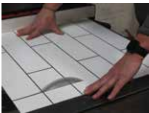
FRP Panels are easily trimmed on a table saw.