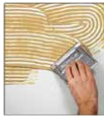
Spread adhesive over the back of the panel.