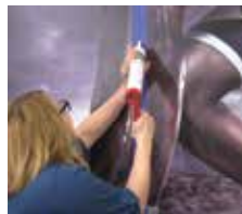
Tape and Apply Silicone