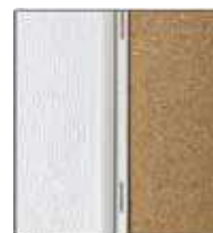
Staple division molding to subwall along resealed edge.