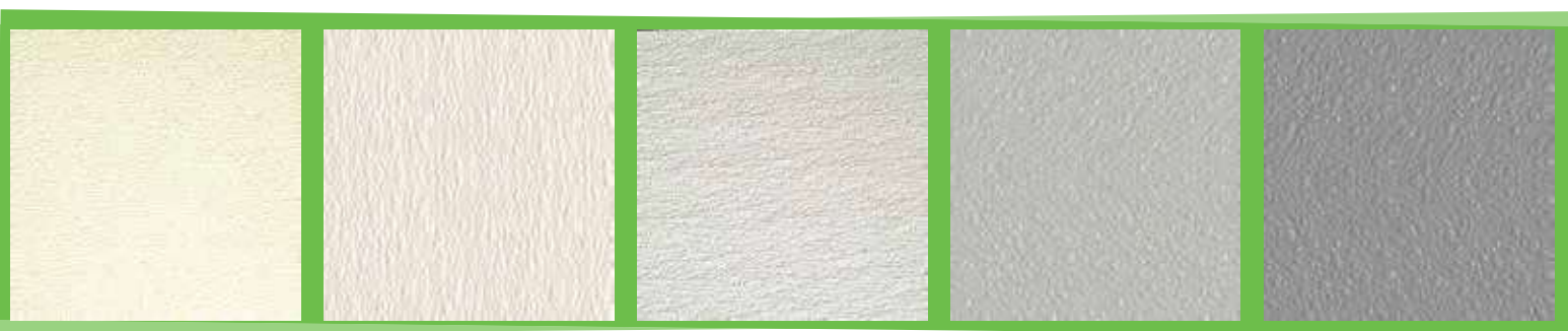
P 140 Ivory Class C* Class A