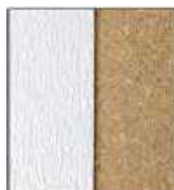
Adhere panel to subwall.