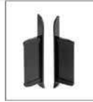
End Caps M625 RH M620 LH