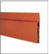
PVC Base Molding 4" wide x 10' long