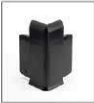
Outside Corner M660