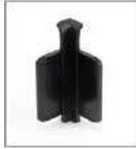
Inside Corner M651