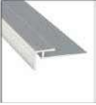
Outside Corner A560