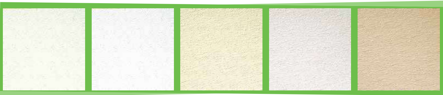
P 100 White Class C* Class A*