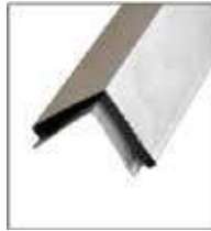
Stainless Corner Guard F560SS