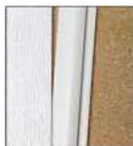
Slide division molding under edge of first panel.