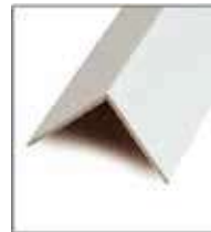
PVC Outside Corner Guard M961