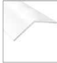
Inside Corner V177 135°