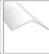
Outside Corner V179 135°