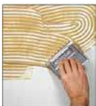
Apply Marlite Brand Adhesive to the back of panels and apply them to a subwall.