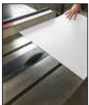
FRP Panels can be easily cut with a table saw.