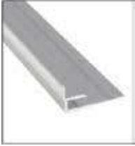
Inside Corner A550