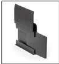
Butt Joint Connector Included with Base Molding Strips