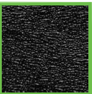
P 807 Black Class C

Approved by Canadian Food Inspection Agency and Agriculture Canada.