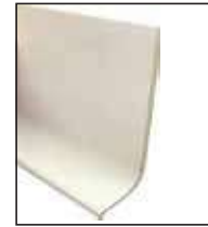
Base Cove V65 3"