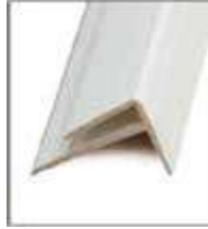
Outside Corner M360