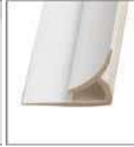
Inside Corner M350