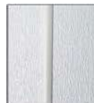
Adhere second panel in place and repeat.