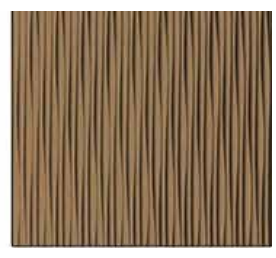
Provide dimension to your wall in your choice of 20 patterns with 9 finish options.