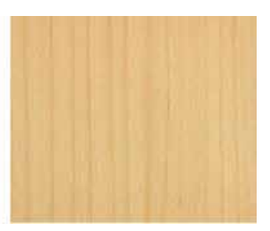
Over 25 species of AA grade veneer are available in 4 distinct premium finish options.