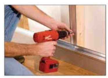
Proprietary wall rails install using ordinary tools.