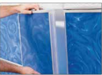
step Panels fit smoothlyand snap securely into the wall framework.