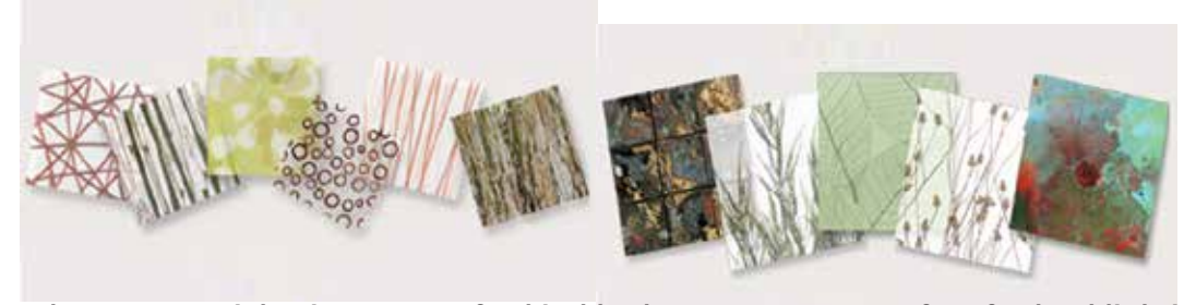
Translucent materials give a one-of-a-kind look to any space. Perfect for backlighting.