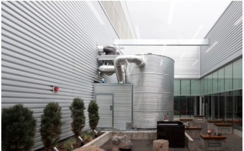
Facebook Data Center, Prineville, OR

Handle and store product according to Metal Sales recommendations. Deliver materials in manufacturer's original, unopened, undamaged containers with identification labels intact. Store materials above ground, under waterproof covering, protected from exposure to harmful weather conditions and at temperature and humidity conditions recommended by