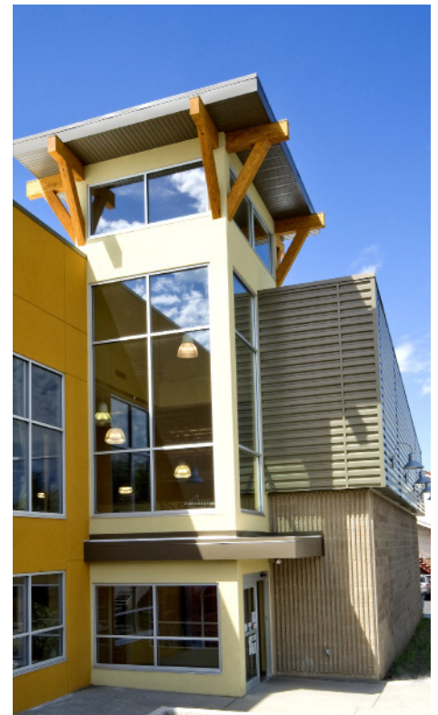
Town and Country Foods, Bozeman, MT

Additional product information is available from the manufacturer upon request. Metal Sales product information may be found in McGraw-Hill Sweets, ARCAT.