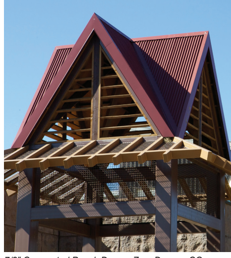
7/8" Corrugated Panel, Denver Zoo, Denver, CO

•UL 263 - Fire Tests of Building Construction and Materials