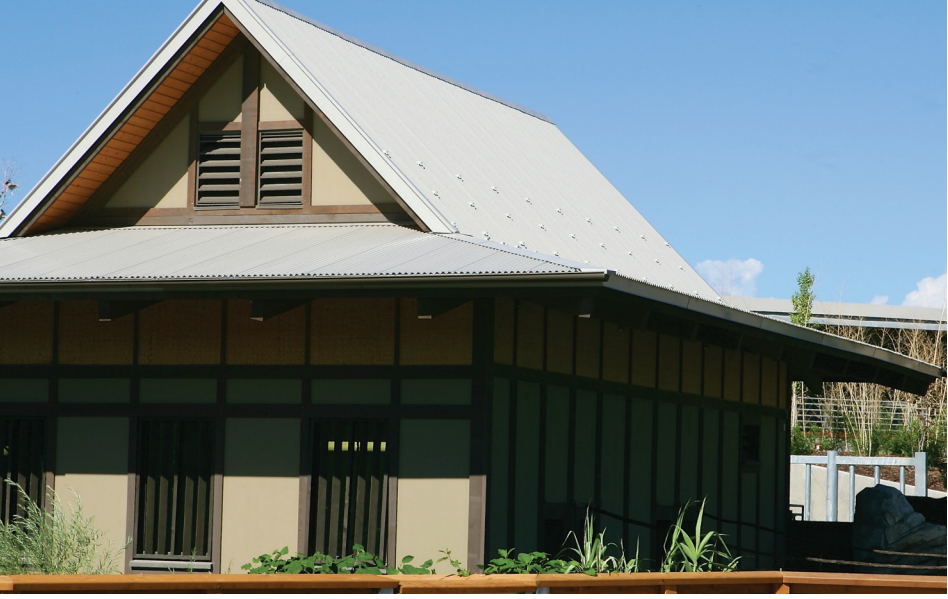
7/8" Corrugated Panels, Denver Zoo, Denver, CO

Impact Resistance: Comply with UL 2218, Class 4 Wind Uplift Resistance: Complies with UL 580, Class 90