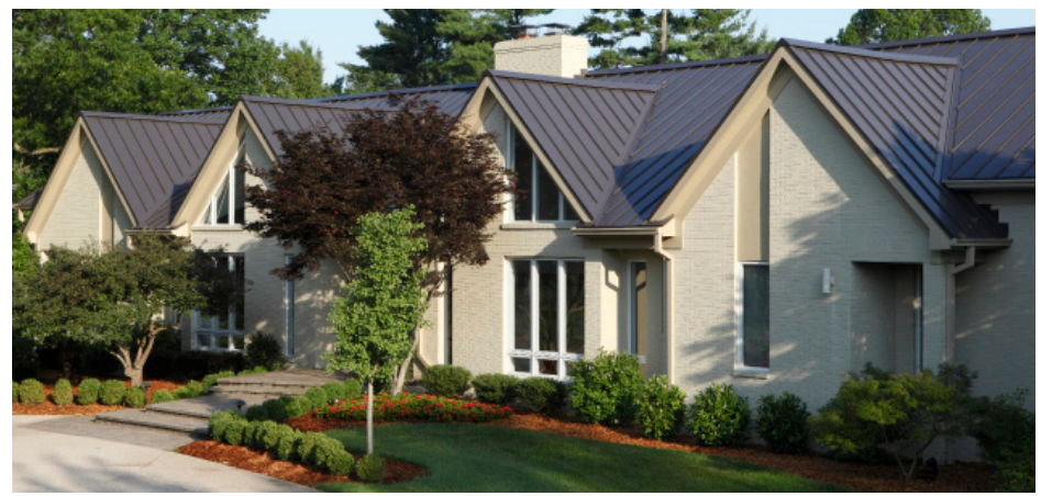
Residence, Louisville, KY

► Rib Height: 1 inch (25.4 mm) or 1-1/2 inches (38.1 mm).