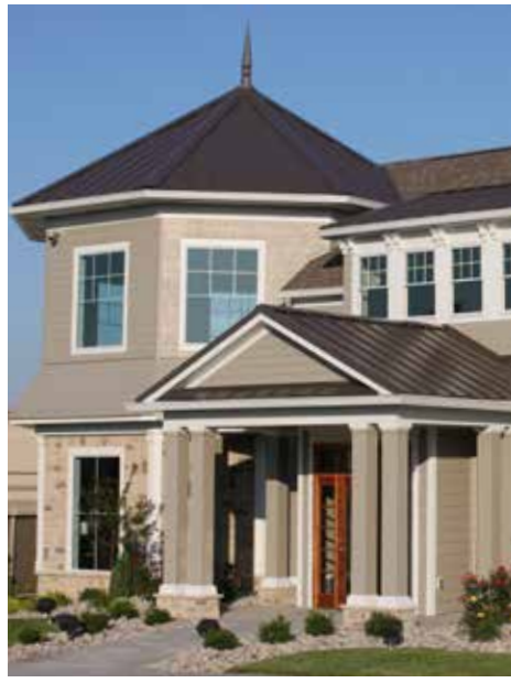
Denzinger Dentist Office, New Albany, IN