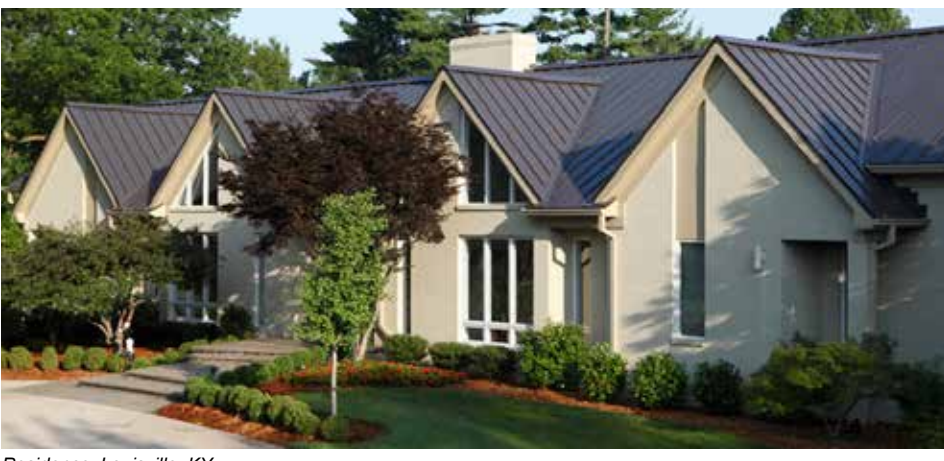
Residence, Louisville, KY

UL Construction #529 ICC Evaluation Report ESR-2385