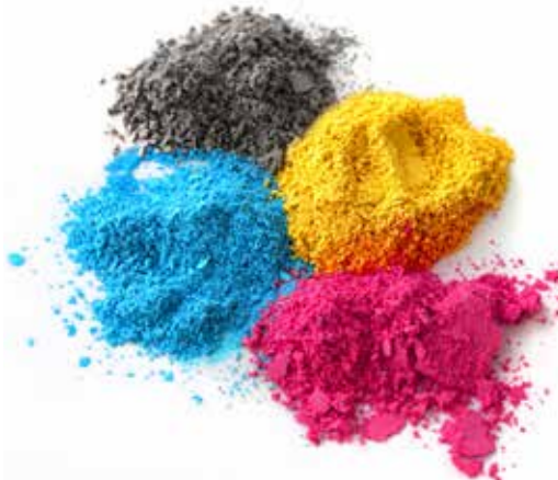
High-quality inorganic and ceramic pigments.

MS Colorfast45 uses a combination of select inorganic and ceramic pigments for coloring. These pigments offer years of exceptional performance in harsh weather and resist color change, acids, alkalis and oxidizing agents found in harsh environments.