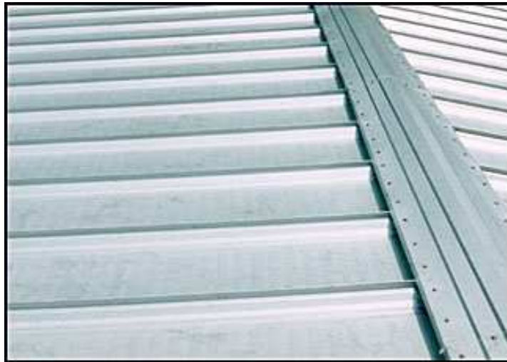
Office Building, Jacksonville, Florida