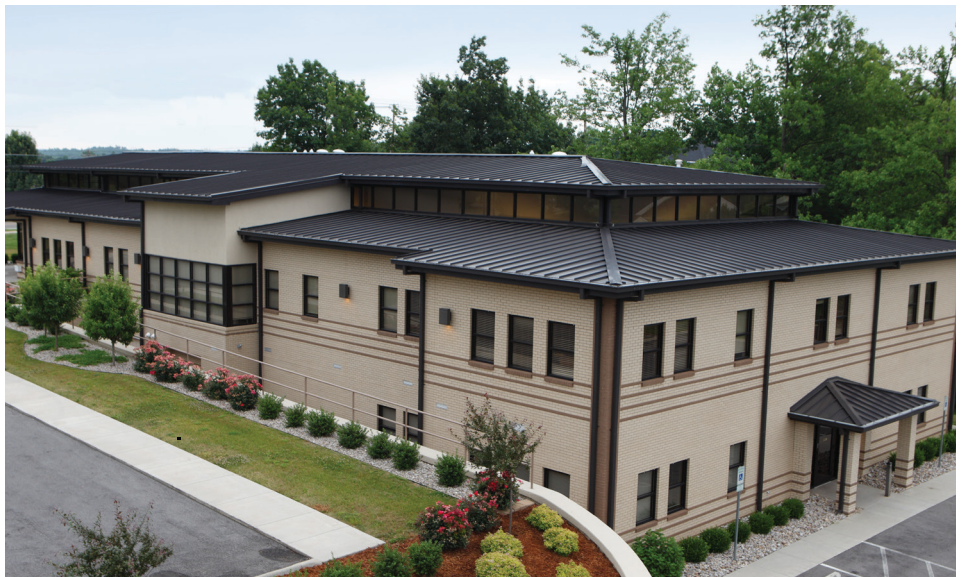
Medical Office, Elizabethtown, KY

Additional product information is available from the manufacturer, upon request and from MasterSpec.