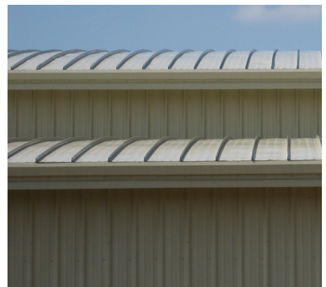
Visitor Center, Tuscon, AZ