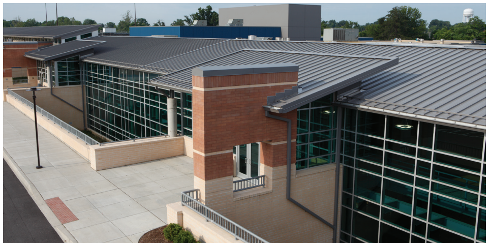
Charlestown High School, Charlestown, IN

After installation remove temporary coverings and protection of adjacent work areas. Repair or replace