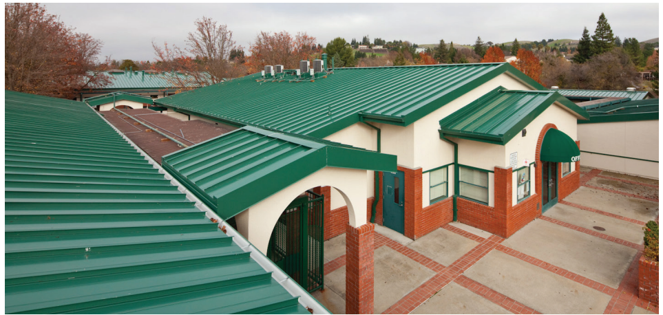
Charlotte Wood Middle School, Danville, CA