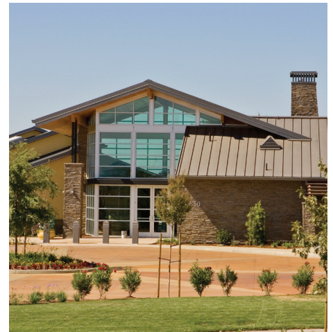
Club Lincoln Crossing, Lincoln, CA

Sheet Metal and Air Conditioning Contractors' National Association (SMACNA): Architectural Sheet Metal Manual