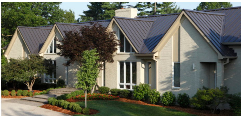
Residence, Louisville, KY

▶ Rib Height: 1 inch (25.4 mm) or 1-1/2 inches (38.1 mm).