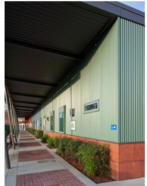
Silicon Valley Animal Center, Milpitas, CA