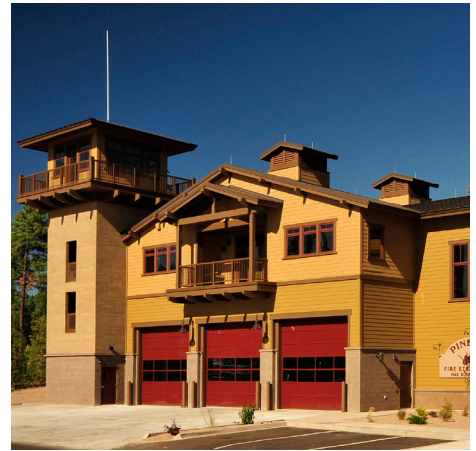
Pinetop Fire Station, Pinetop, AZ

Seam-Loc 24 is a registered trademark of Metal Sales.