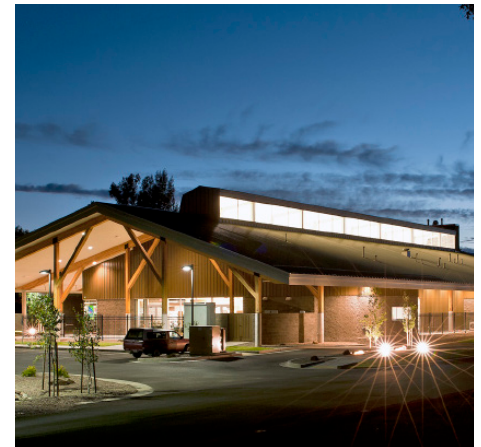
Show Low Library, Show Low, AZ

tural Standing Seam Aluminum Roof Panel Systems ●ASTM E 1646 - Standard Test Method for Water Penetration of Exterior Metal Roof Panel Systems by Uniform Static Air Pressure Difference ●ASTM E 1680 - Standard Test Method for Rate of Air Leakage through Exterior Metal Roof Panel Systems