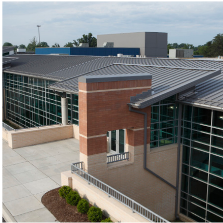
Charlestown High School, Charlestown, IN