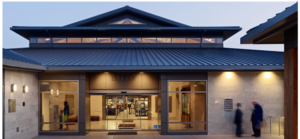
Lafayette Library and Learning Center, Lafayette, CA

If requested by Owner, provide manufacturer's field service consisting of product use recommendations and periodic site visits for inspection of product installation in accordance with manufacturer's instructions.