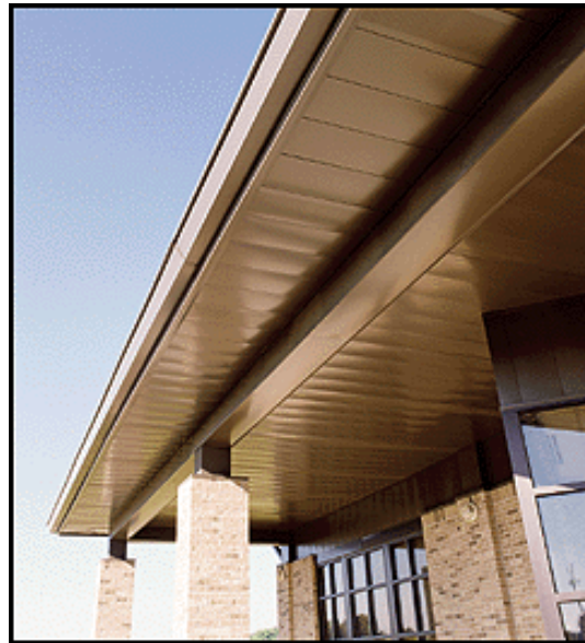
Commerce Center, Sellersburg, IN