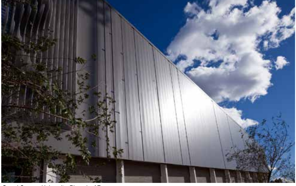
Grand Canyon University, Phoenix, AZ

Technical Properties for Verti-Line Series T10-A,