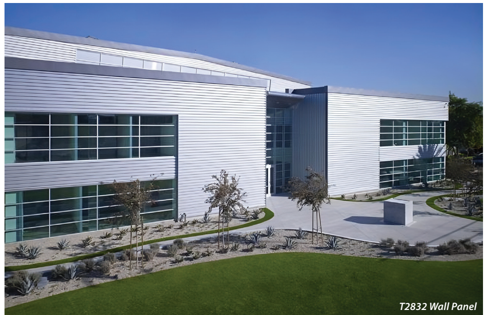
T2832 Wall Panel