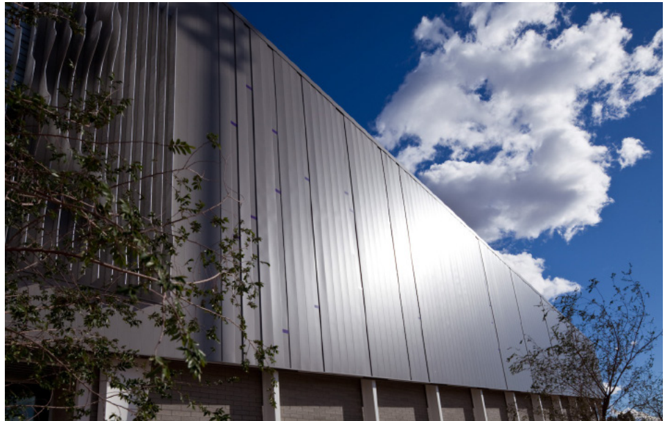
Grand Canyon University, Phoenix, AZ

▶ Material: Aluminum-zinc alloy-coated steel sheet, ASTM A 792, AZ50 or AZ55 coating designation, structural quality, Grade 50, 0.0236 inch (0.60 mm) or 0.0296 inch (0.75 mm) minimum thickness.