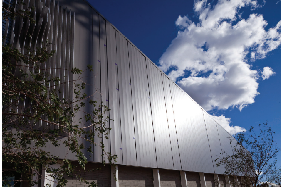
Grand Canyon University, Phoenix, AZ

Note: Industry designation for material thickness is moving away from "gauge" to decimal thickness in inches. Metal Sales recommends use of a minimum thickness requirement 0.0230 inch (0.58 mm) instead of 24 gauge, 0.0296 inch (0.75 mm) instead of 22 gauge, 0.0356 inch (0.90 mm) instead of 20 gauge and 0.0466 inch (1.18 mm) instead of 18 gauge. For Galvalume-coated steel, specify AZ50 for painted material or AZ55 for unpainted material.