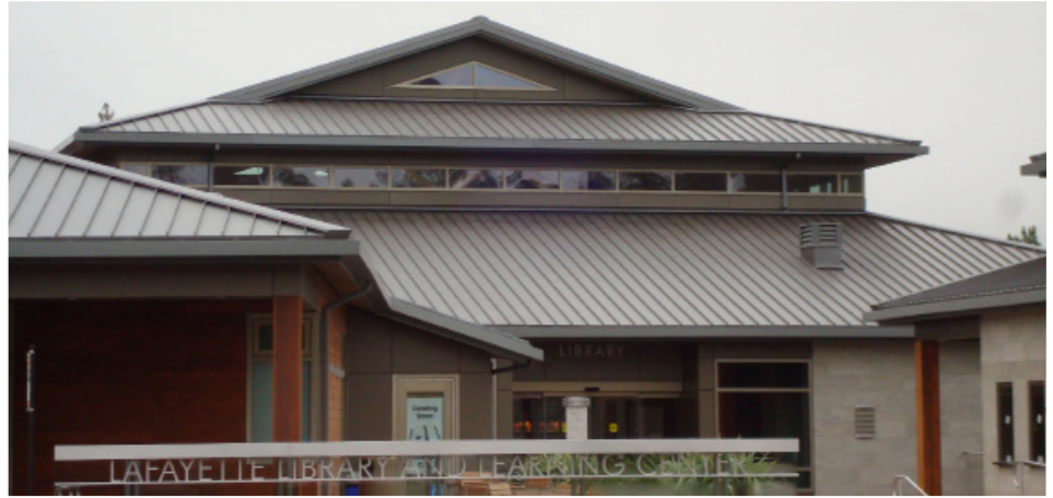
Lafayette Library and Learning Center, Lafayette, CA

Construction metals generally are readily recyclable at the end of their service life. The raw materials used in manufacture of standing seam panels also come from recycled sources. Post industrial and post consumer recycled content varies.