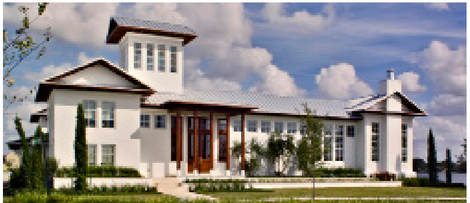
Tradewinds Model Home, FL

Additional product information is available from the manufacturer upon request. Metal Sales product information may be found in McGraw-Hill Sweets, BSD SpecLink and Arcom MasterSpec.