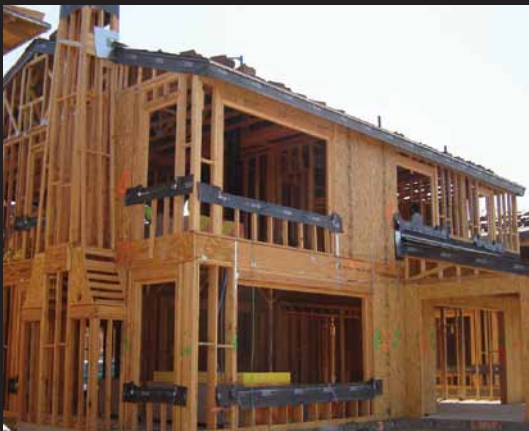
Putting FutureFlash® to work with our 3FPS (FutureFlash® Flexible Pan System) is the best way to prevent water intrusion at all window and door locations.