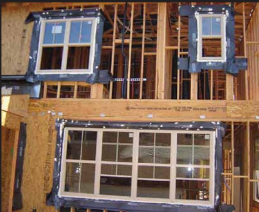
FutureFlash® offers high strength, high elongation and is flexible to accommodate expansion and contraction of the substrate.