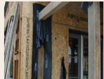
FutureFlash® can be used to waterproof beams and posts that are attached to the structure.