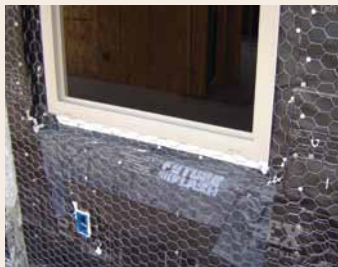
FutureFlash® creates a drainage channel to divert water away from the wall cavity to prevent interior damage and toxic mold.