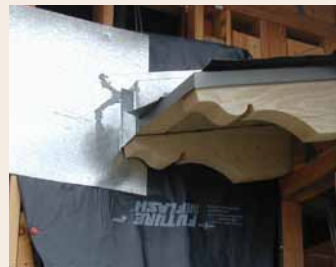
Tough, UV-friendly FutureFlash® prevents leaks at a fascia board/wall termination and separates dissimilar metals to prevent corrosion.