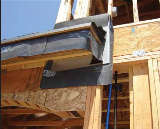
FutureFlash® is an excellent choice for prelining of all metal transitions.