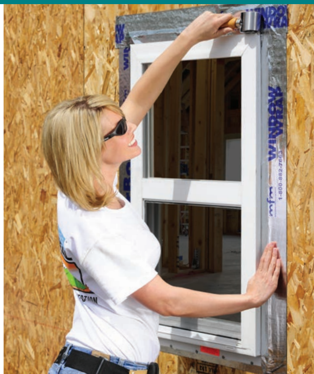
The WindowWrap® family of products are self-adhering, self-sealing waterproofing tapes designed for use around windows, doors, building seams and in general construction.