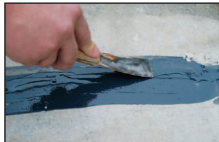
PRESS INTO CRACK AND SPREAD ONTO ADJACENT SURFACE.

Reuse: Partially used tubes can be stored and re-used. Remove the used mixing tip and discard as they can not be re-used. Attempting to re-use a used mixing tip will damage the tube and render it useless. After used tip has been removed, wipe excess material from end of cartridge, re-install the cap and collet.