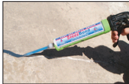
FILL CRACK WITH SPEED BOND