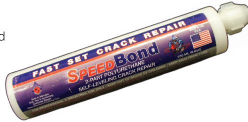
ENVIRONMENTALLY SAFE, WATERBASE