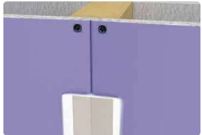
1 All joints and interior angles have tape set in compound.