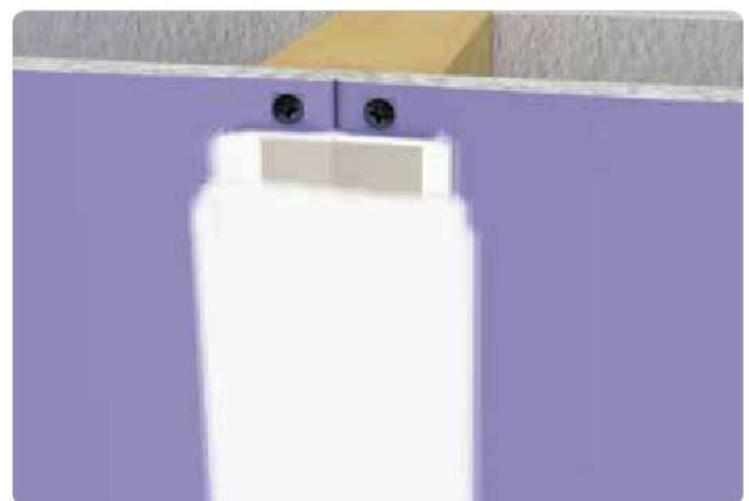
2 Thin coating of compound over all joints and interior angles.