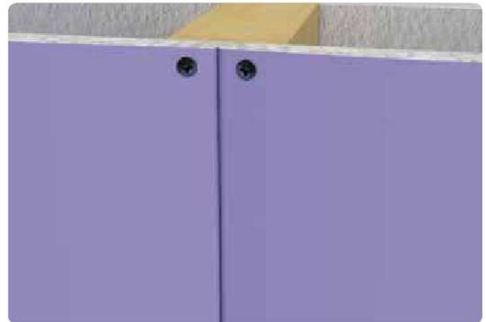
0 No taping, finishing or accessories required.

Note: It is recommended that the final decoration specification (e.g., painting specification) include the application of a priming material prior to the decoration.