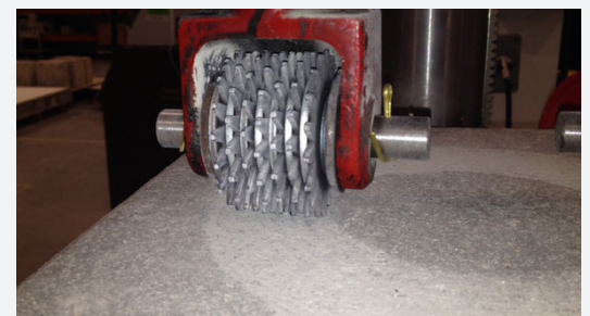
The ASTM C779 Procedure B uses steel dressing wheels to test the abrasion resistance of concrete surfaces. (Source: Nelson Testing Laboratories)