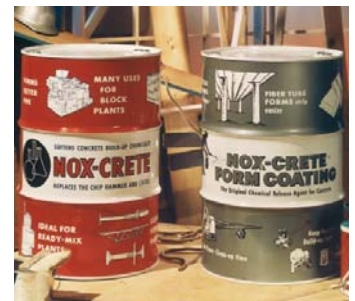
DEACTIVATOR FORM COATING