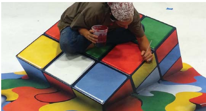
DURO-FLOOR COLOR SYSTEM

A three part system that combines Duro-Nox LSC lithium silicate densifier, Duro-Color Concentrated dye and Duro-Shield floor polish, stain and fade protectant. Transforms plain gray colored interior concrete floors into beautiful brightly colored, high gloss, stain and slip resistant, polished concrete floors. Designed for commercial retail, office, sporting arena, convention center and institutional floors. Beautifies, strengthens, dustproofs and increases the abrasion and impact resistance of diamond polished concrete floors.