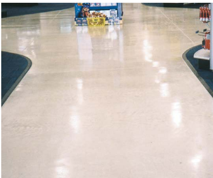
DURO-FLOOR CLASSIC SYSTEM

Original, high performance formulation hardens, seals, densifies and dustproofs new and existing concrete floors. Increases abrasion, impact and wear resistance. Develops a lustrous, marble-like sheen that continues to improve through regular use. 20-year performance warranty available.