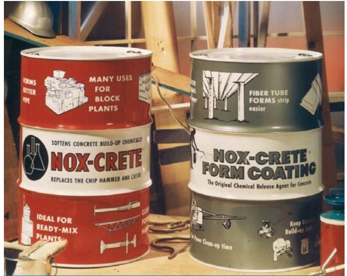
DEACTIVATOR • FORM COATING