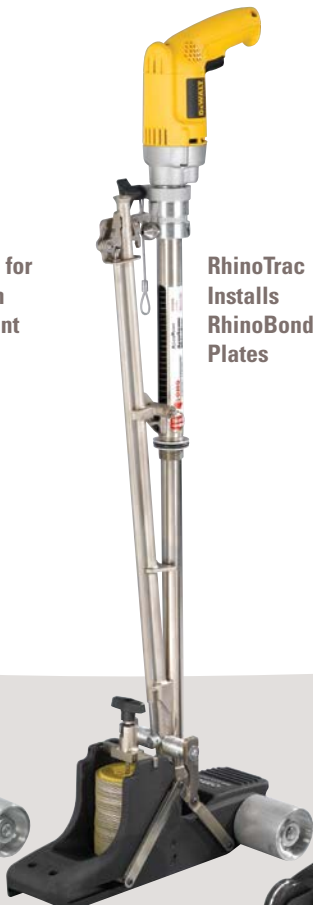
RhinoTrac Installs RhinoBond Plates