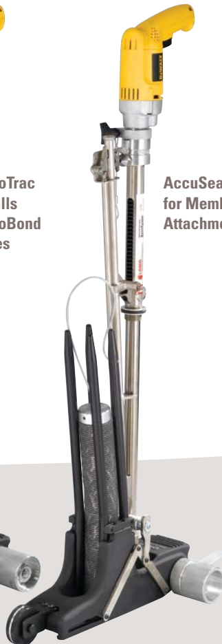
AccuSeam for Membrane Attachment