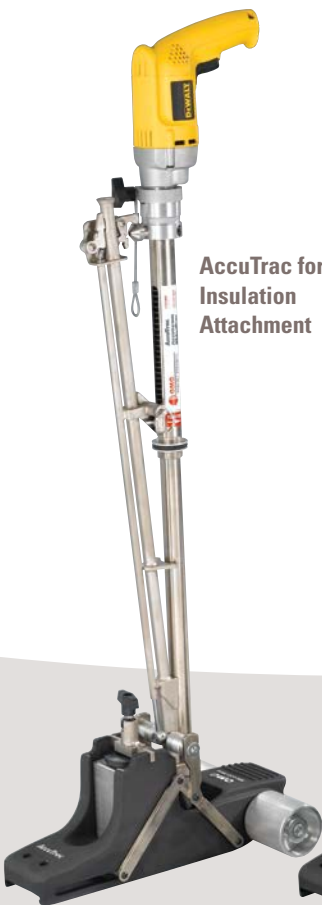
AccuTrac for Insulation Attachment

RhinoTrac eliminates over- and under-driving of RhinoBond plates for optimal welding of thermoplastic membranes.