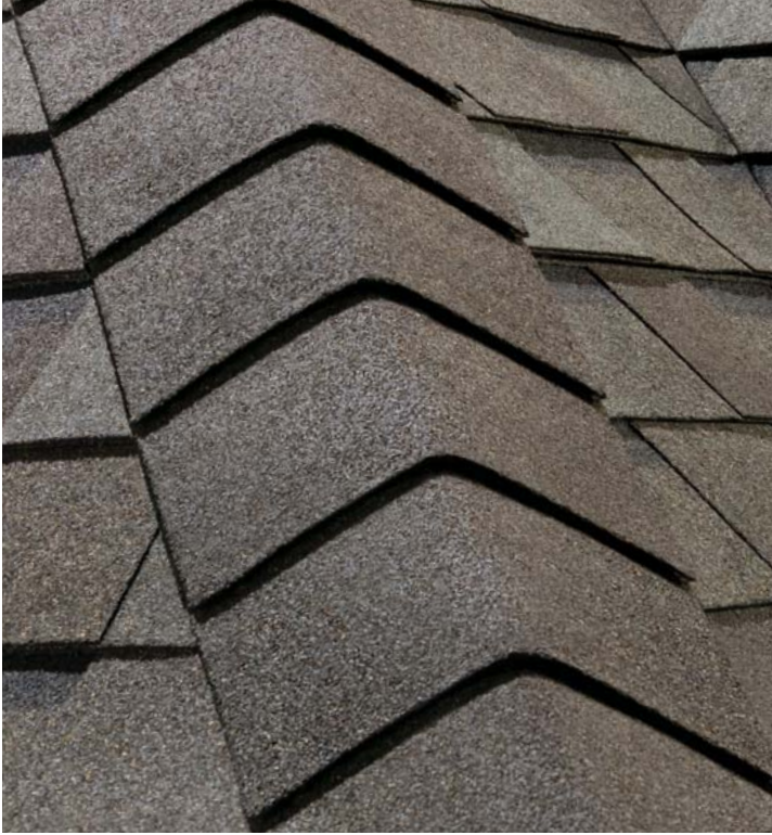
RIZERidge® Hip & Ridge Shingles

RIZERidge Hip & Ridge shingles offer a stylish higher profile and more consistent look compared to cut-tab shingles.