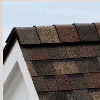
Summer Harvest †

RIZERidge® Hip & Ridge shingles also coordinate with the TruDefinition® Duration® Designer Colors Collection—this unique color-blended application is only available from Owens Corning Roofing.