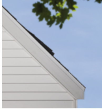
▲ Lower-roof application ►