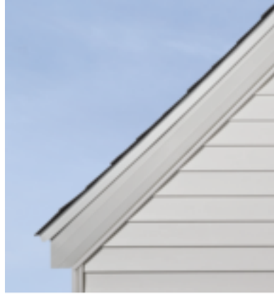
◀ At-eave application ▲