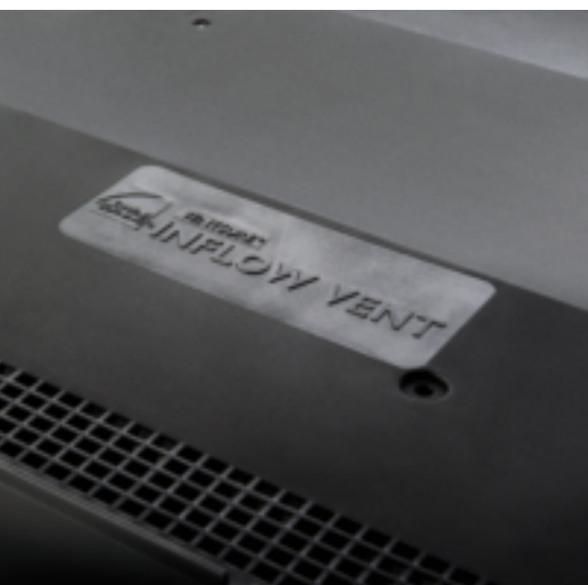
◀ Durable construction for long-lasting performance; mesh top minimizes debris collection