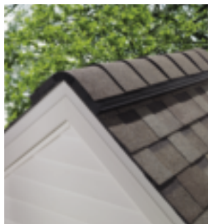
VentSure® 4-Foot Strip Ridge Vent complements the VentSure® InFlow™ Vent for balanced intake and exhaust

On homes with soffits, the VentSure® InFlow™ Vent can supplement or replace existing under-eave vents. On soffit-less or exposed-rafter homes, it can be installed on the lower roof, drawing air through the top of the vent. Plus, the VentSure® InFlow™ Vent can be easily installed by your contractor as part of your reroofing process.