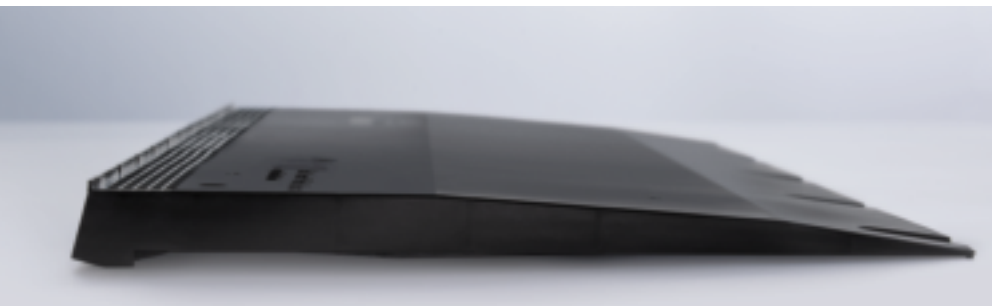
▲ Blends into roofline with a low-profile, 3-plane design ►