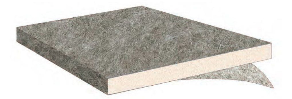
Figure 1 Generic glass-mat gypsum board

This study does not cover glass-mat gypsum panels used in interior wall and ceiling applications (ASTM C1658). In addition, this study does not cover glass-mat gypsum roof board (ASTM C1177), glass-mat gypsum panel abuse & impact resistant (ASTM C1629), and glass-mat gypsum tile backer (ASTM C1178). Figure 1 below provides a visual of a glass mat panel.