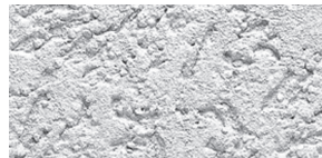
531 SWIRL COARSE