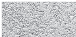
530 SWIRL FINE