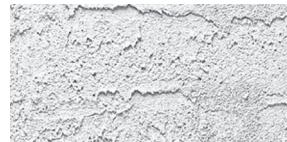
532 MULTI TEXTURE