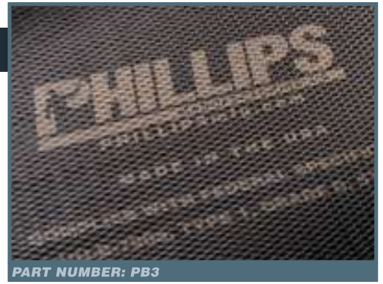
PART NUMBER: PB3

Asphalt saturated kraft building paper has been applied to the lath to control moisture, air flow and reduce air infiltration resulting in improved energy efficiency. Paper Back Lath is easy to install and ideal as a base for stone, ceramic tile and traditional stucco. The paper backing aids in plaster keying and stucco curing, protection of the sheathing during curing and forms the vertical surface behind the exterior wall cladding (stucco, brick, siding, etc.) that allows moisture to safely drain out of the wall system. The asphalt paper back breather sheet complies with Federal Specification UU-B-790A: Type 1, Grade D, Style 2 which is printed on the paper for easy identification. Paper Back is available with Flat Diamond Mesh Lath, Self-Furring Dimpled Diamond Mesh Lath and Self-Furring V-Groove Diamond Mesh Lath, Paper Backed Self Furring Diamond Mesh Lath and Paper Backed Flat Diamond Mesh Lath.