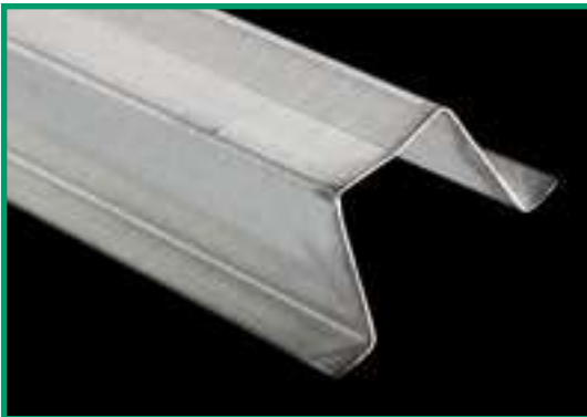
PART NUMBER: 150F125