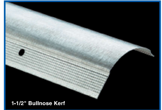
1-1/2" Bullnose Kerf