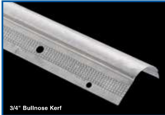
3/4" Bullnose Kerf