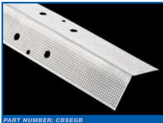
PART NUMBER: CBSEGB