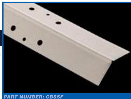
PART NUMBER: CBSSF

Phillips ShadowFree® splay corner bead is the perfect color and texture for a superior finish on open angles exceeding 120°. This product is primed over a hot-dipped galvanized steel surface coating for excellent corrosion prevention and to ensure quality mud and paint adhesion. Phillips exclusive ShadowFree® surface coating helps prevent shadowing and cuts down on finishing time.