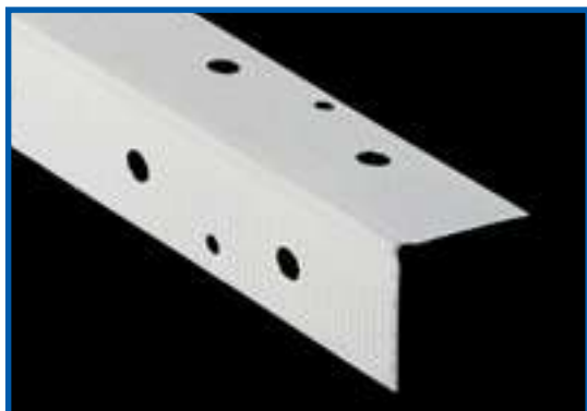
PART NUMBER: CBRSF