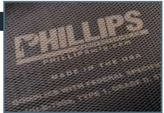
PART NUMBER: PB3

Asphalt saturated kraft building paper has been applied to the lath to control moisture, air flow and reduce air infiltration resulting in improved energy efficiency. Paper Back Lath is easy to install and ideal as a base for stone, ceramic tile and traditional stucco. The paper backing aids in plaster keying and stucco curing, protection of the sheathing during curing and forms the vertical surface behind the exterior wall cladding (stucco, brick, siding, etc.) that allows moisture to safely drain out of the wall system. The asphalt paper back breather sheet complies with Federal Specification UU-B-790A: Type 1, Grade D, Style 2 which is printed on the paper for easy identification. Paper Back is available with Flat Diamond Mesh Lath, Self-Furring Dimpled Diamond Mesh Lath and Self-Furring V-Groove Diamond Mesh Lath, Paper Backed Self Furring Diamond Mesh Lath and Paper Backed Flat Diamond Mesh Lath.