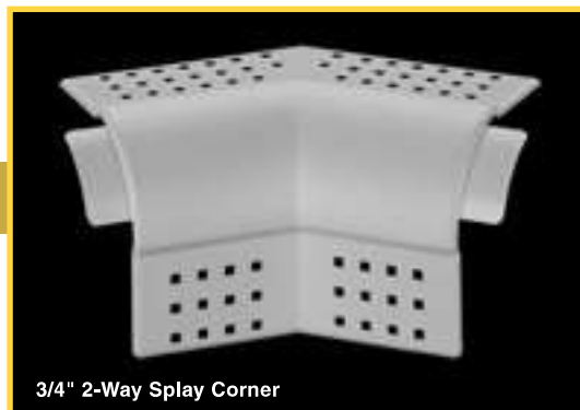
3/4" 2-Way Splay Corner

Phillips gripSTIK® 2-way splay corners are designed to easily finish where two splayed outside bullnose corners intersect at angles greater than 90° or open angles. This product works great to corner cap windows, closets, doorways, skylights and other areas. Corner caps eliminate the need for mitering and corner filling, saving time and reducing waste. Perforated to enhance mud adhesion. Alignment tabs make it easy to match with Phillips metal, vinyl or paper faced metal bullnose corner beads. Available in 3/4" (CAP235). Packaging is 50 pieces per carton.