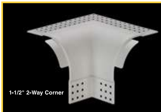
1-1/2" 2-Way Corner

Phillips gripSTIK® 2-way corners are designed to easily finish two intersecting 90° outside bullnose corners. This product works great to cap corners of windows, closets, doorways, skylights and other areas. Corner caps eliminate the need for mitering and corner filling, saving time and reducing waste. Perforated to enhance mud adhesion. Alignment tabs make it easy to match with Phillips metal, vinyl or paper faced metal bullnose corner beads. Available in 1/2" (Mini) (CAP245), 3/4" (CAP285) and 1-1/2" (CAP287). Packaging is 50 pieces per carton.