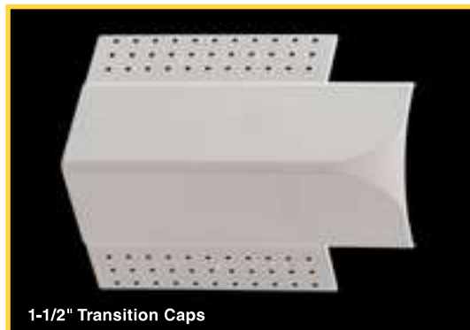
1-1/2" Transition Caps