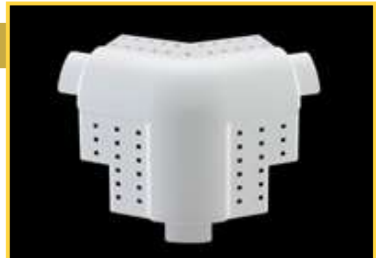
PART NUMBER: CAP135