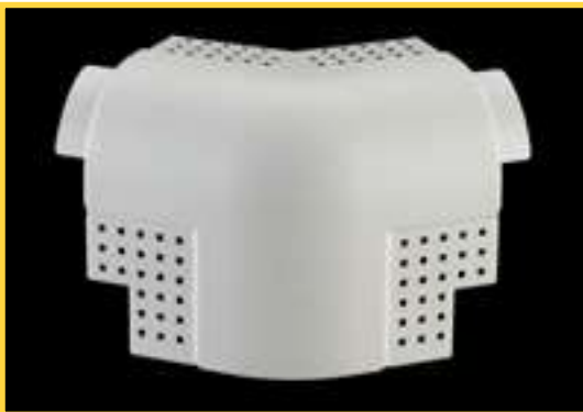
PART NUMBER: CAP187

Phillips gripSTIK® 3/4" 3-way splay corner is designed to easily finish where two 90° outside 3/4" bullnose corners intersect with one outside bullnose splay corner. This product eliminates the need for mitering and corner filling, saving time and reducing waste. Alignment tabs make it easy to match with Phillips metal, vinyl or paper faced metal bullnose corner beads. Perforated to enhance mud adhesion. Also available in 1-1/2" (CAP187 - see below) radius. Packaging is 50 pieces per carton.