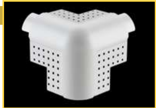
PART NUMBER: CAP385