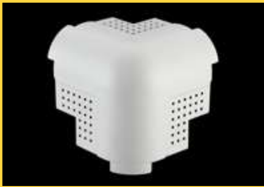
PART NUMBER: CAP387

Phillips gripSTIK® 3/4" 3-way corner is designed to easily finish three intersecting bullnose 90° outside corners. This product eliminates the need for mitering and corner filling, saving time and reducing waste. Alignment tabs make it easy to match with Phillips metal, vinyl or paper faced metal bullnose corner beads. Perforated to enhance mud adhesion. Also available in 1/2" (CAP345) and 1-1/2" (CAP387 - see below) radius. Packaging is 50 pieces per carton.