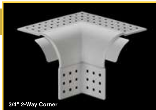
3/4" 2-Way Corner