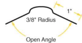
Drawing not to scale

All Phillips products are made in the U.S.A.