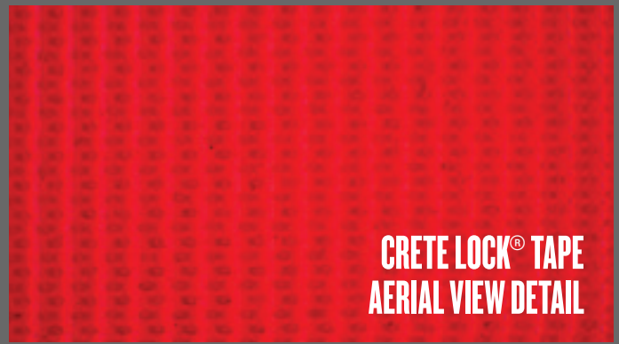
CRETE LOCK ® TAPE AERIAL VIEW DETAIL

*Specimens stretched and failed before pulling the tape out of concrete