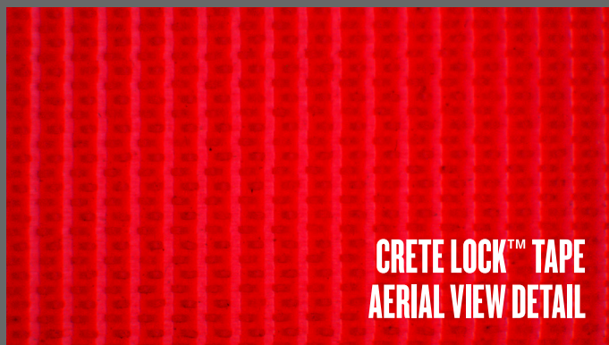
CRETE LOCK™ TAPE AERIAL VIEW DETAIL

CONTACT POLY-AMERICA'S SALES DEPARTMENT WITH QUESTIONS OR FOR PRICING AND LOCAL DISTRIBUTION OPTIONS.