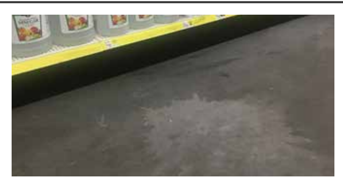
ACIDIC FOOD (COLA, MILK, PICKLES, MUSTARD, ETC.) Immediately clean with fresh water or DailyKlean*. Acids will etch concrete if not removed guickly.