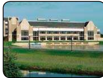
Medtronic Inc. worldwide headquarters, Minneapolis, Minn. —exterior cleaning with PROSOCO products.