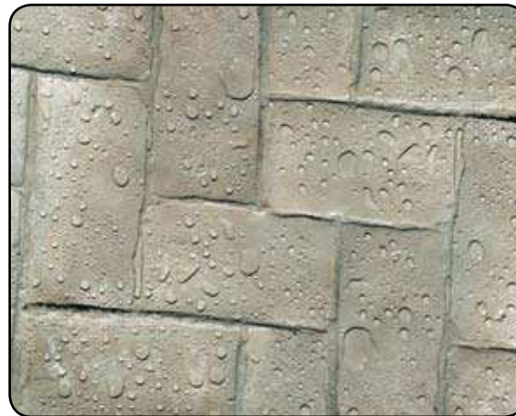
PROSOCO products protect this decorative concrete from damaging water penetration.

You get a property that attracts business—an appearance you can be proud of.