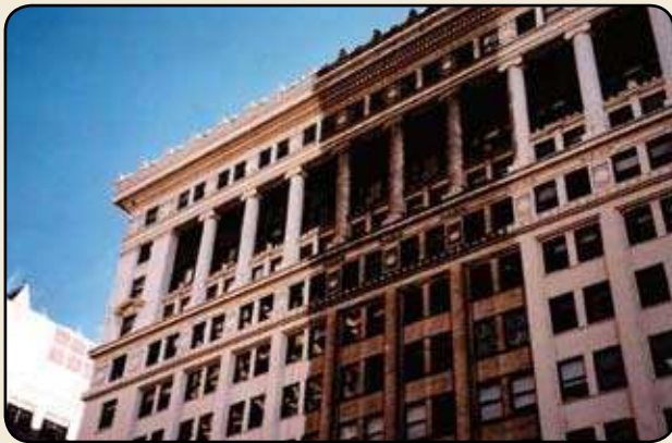
Insurance Exchange, Chicago, Ill.—exterior cleaning with PROSOCO products.

What message does the appearance of your place of business send?