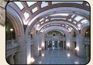
Cuyahoga County Courthouse, Cleveland, Ohio—Interior cleaning with PROSOCO products.