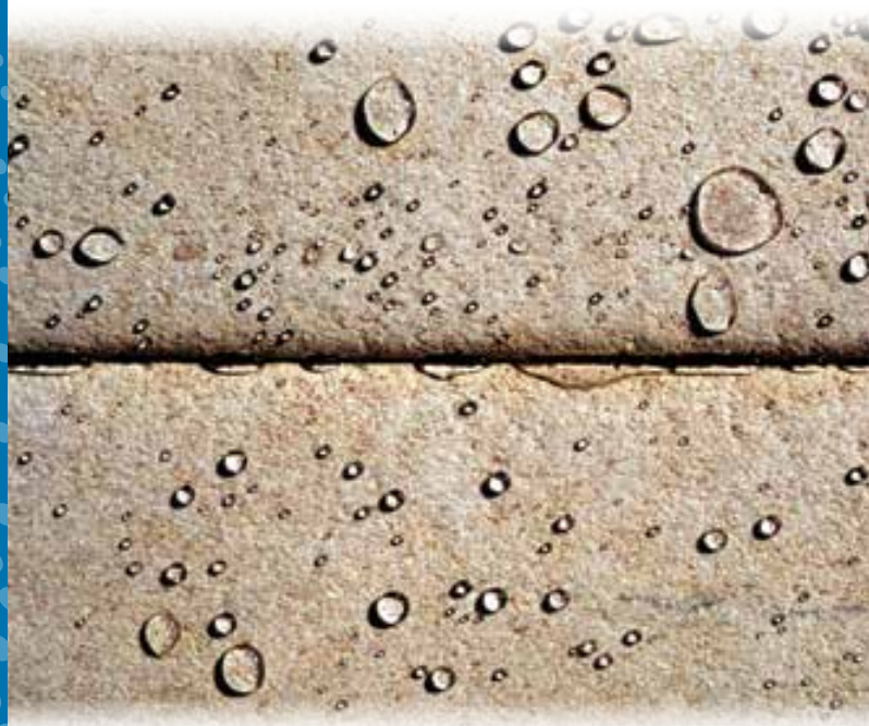
Water beads up on a composite deck treated with PSC Composite Deck Protector.

Tough as they are, wet composite decks still provide a home for mold and mildew. Keep rain and spills of food and drink from soaking in with easy-application Composite Deck Protector. Specially designed for composites, this VOC-compliant protective treatment won't change the appearance, color or texture of the deck – and it won't let anything else change it either! Makes maintenance cleaning easier, too.