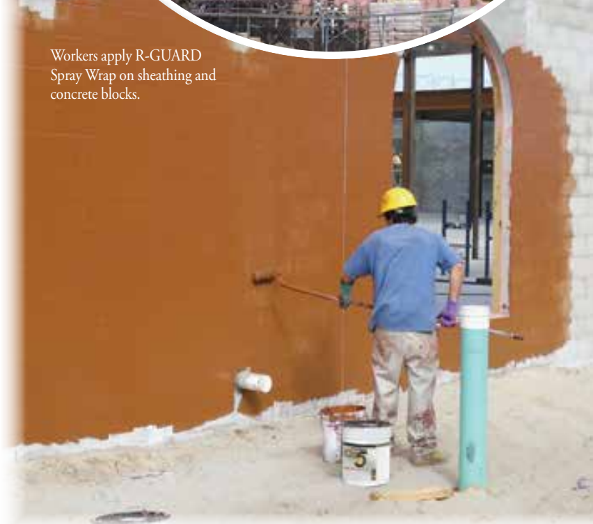
A technician uses a roller to easily apply R-GUARD Cat 5 to concrete block.