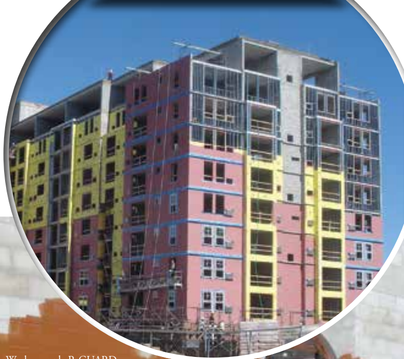
Workers apply R-GUARD Spray Wrap on sheathing and concrete blocks.

Water-based, vapor impermeable air and water-resistive VB minimizes damaging air and water intrusion into structural walls.