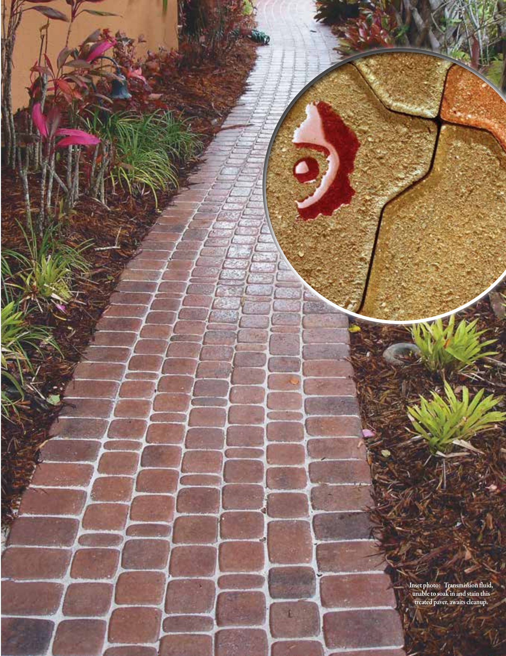
Inset photo: Transmission fluid, unable to soak in and stain this treated paver, awaits cleanup.