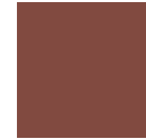
El Rancho Red