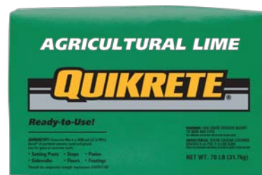
QUIKRETE® Agricultural Lime (#1111-50)

QUIKRETE® Agricultural Lime is finely ground calcium carbonate, suitable for neutralizing soil acidity. This type of lime is not suitable for use in the manufacture of mortars or stuccos.