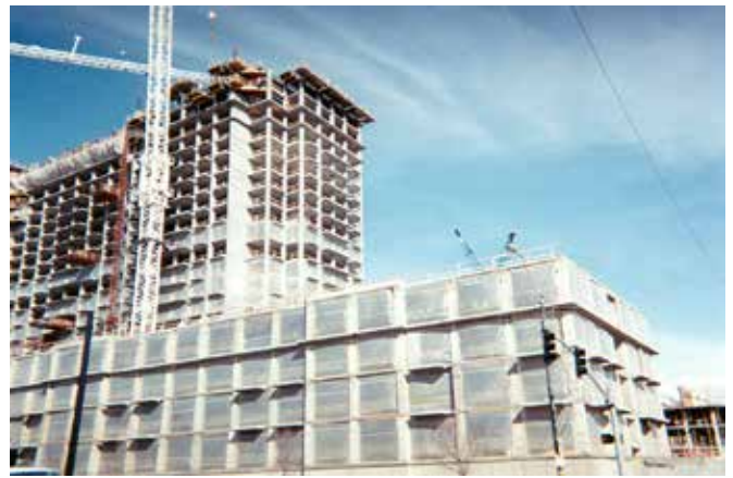
Building Abatement Enclosure