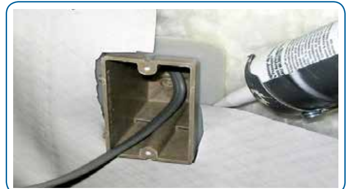
STANDARD ELECTRICAL BOX