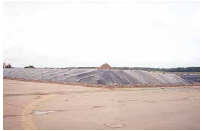
Construction Site Covers